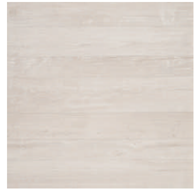
AXI White Pine

Dimensions 23.54" x 23.54" x 0.79" (598 x 598 x 20 mm) Weight 36.38 lbs (16.50 kg) Weight psf 9.45 psf (46.14 kg/m 2 ) Solar Reflectance Index 29 SRI