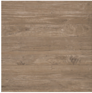
AXI Brown Chestnut

Dimensions 23.54" x 23.54" x 0.79" (598 x 598 x 20 mm) Weight 36.38 lbs (16.50 kg) Weight psf 9.45 psf (46.14 kg/m 2 ) Solar Reflectance Index 30 SRI