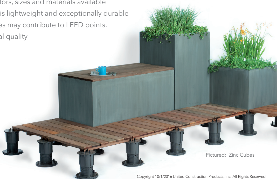
Pictured: Zinc Cubes