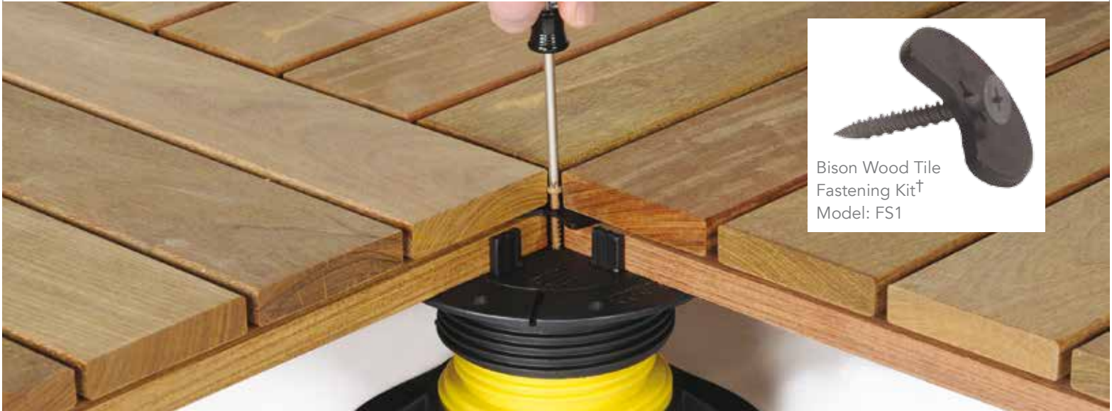
Bison Wood Tile Fastening Kit† Model: FS1